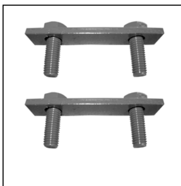
Bolt Plates ( The picture only for reference)