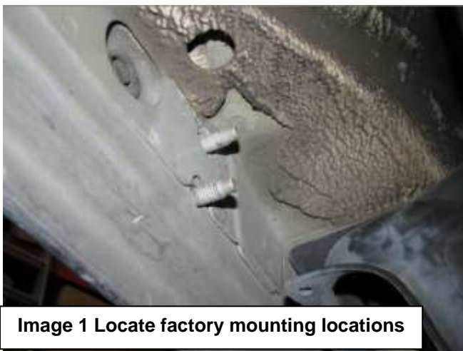
Image 1 Locate factory mounting locations