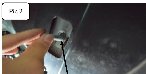
Insert the T Bolt

Step 4: Refer to Pic 3 to install Middle Bracket. Fix with (15) (16) (13) (14).