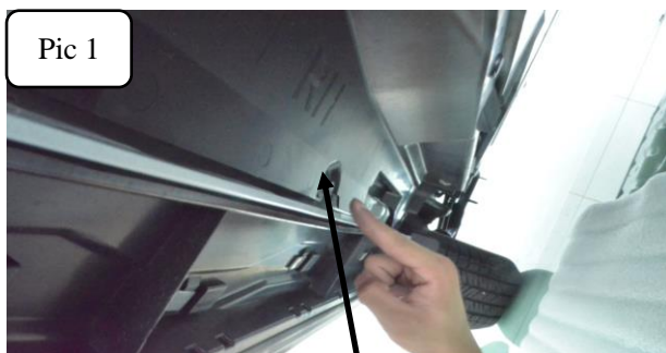
Remove the mud flap

Step 3: Refer to the following picture to install the front bracket with T Bolt 2, then insert T Bolt 1 refer to Pic 2. Fix the bracket with (8), (9) and (10).