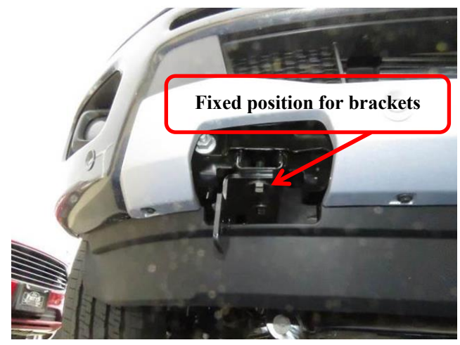
Step 4: Connect Step 2 grille guard with the brackets. Align the Grille Guard properly and tighten all hardware.

Step 5: Installation finished, pick up all tools.