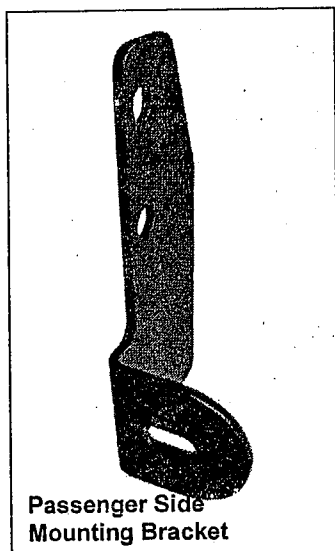
Passenger Side Mounting Bracket