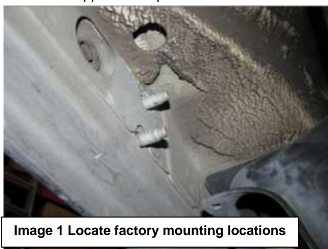
Image 1 Locate factory mounting locations