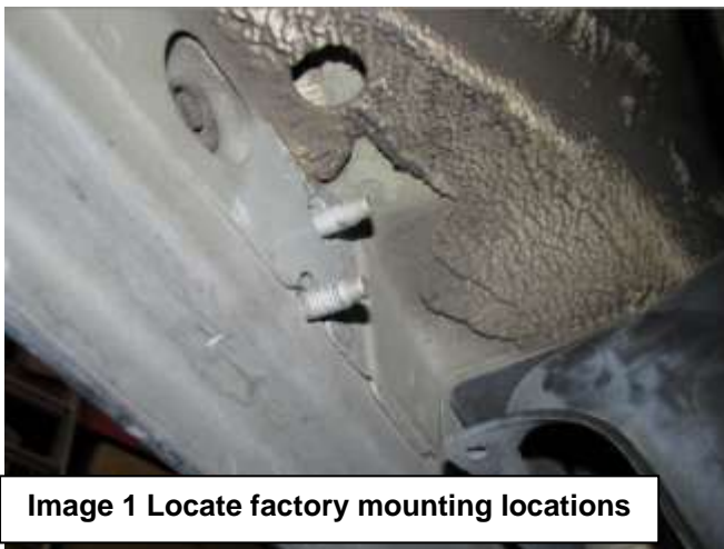
Image 1 Locate factory mounting locations